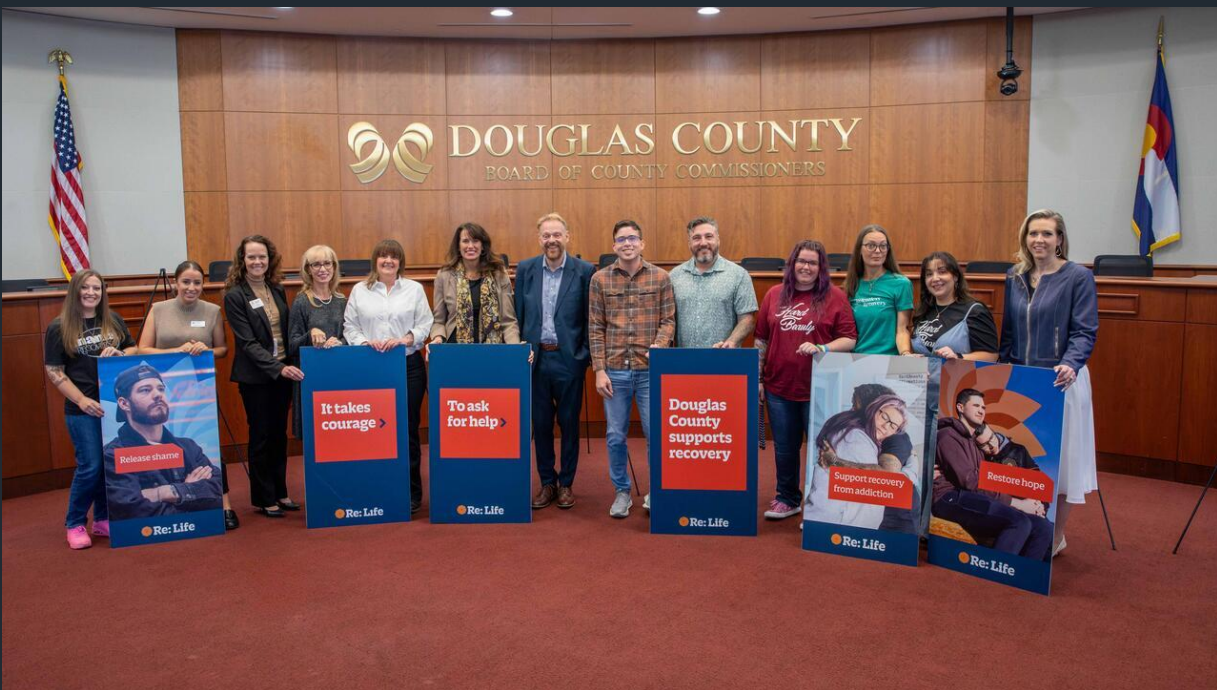
The Douglas County Opioid Council at their awareness campaign launch on Sept. 25.

DCCF works in partnership with the DCOC to manage and administer the Region 12 Opioid Abatement Council Emergency Fund. To receive this funding, organizations must demonstrate that their primary mission or a significant part of their work focuses on opioid and substance use disorder prevention (OUD/SUD), intervention, treatment, recovery, or harm reduction, and qualified organizations need to state an emergency status for the funding.