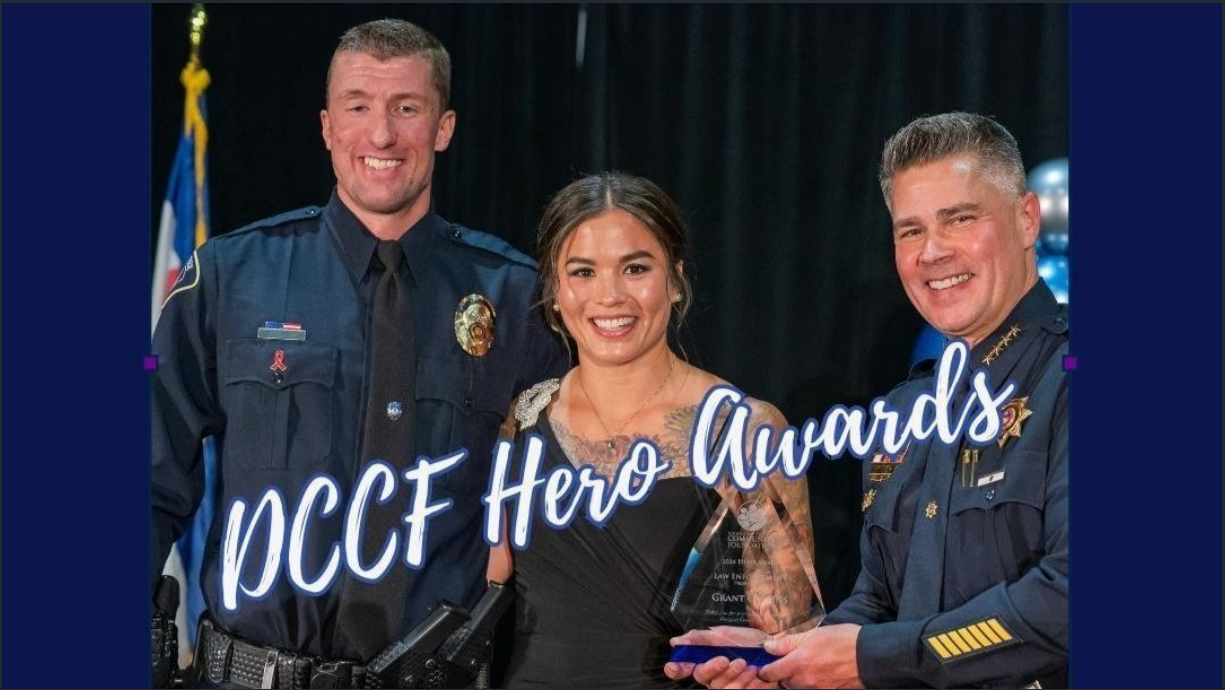
DCCF 2024 Hero Award recipients.

DCCF is seeking nominations for its Hero Awards, which recognize the service and valor of Douglas County first responders, Armed Forces members, and community heroes doing transformative work serving people in Douglas County.