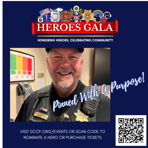
DCCSO Deputy is Pinned With A Purpose.

DCCF is proud to partner with the Douglas County Sheriff's Office and unveil a special surprise at the third annual DCCF Heroes Gala on September 12th honoring first responders, military personnel and veterans.